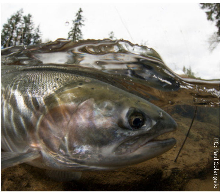
Steelhead in North Umpqua River.

It's time to close the loophole that's letting water right changes sidestep modern environmental values. As changing old water rights become a primary mechanism to satisfy new water uses, Oregon Legislators have a critical window to pass SB 427 and safeguard our streams and the ecosystems, economies, and cultural connections they sustain.