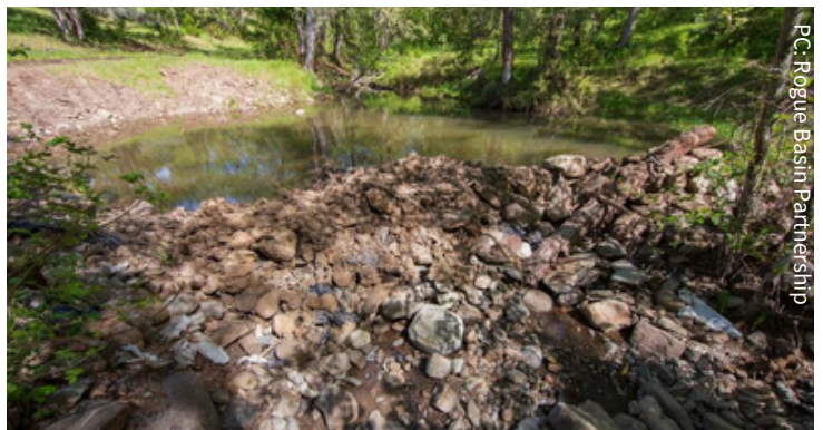
Push up dam dewatering stream below diversion in Rogue Basin.

Oregon receives approximately 250 water right change applications annually, an average that is ticking upward as fewer new water rights are issued. That means we need to act now to ensure our natural water supplies aren't further diminished. SB 427 is a critical and efficient approach to safeguarding existing flows in the face of new water demands and pressures.