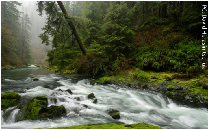
Drift Creek in Siletz River Basin.

New water rights take into account instream values, like fish health and water quality-but old water rights can be changed with zero environmental review. It's time to close the loophole.